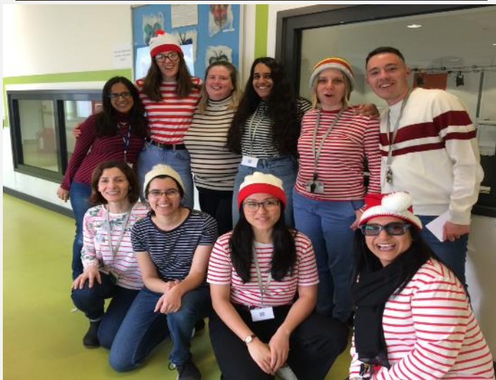
Look at the Chicks Hatch