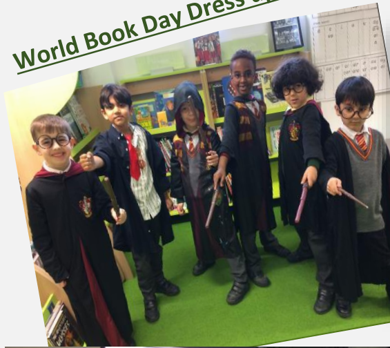
World Book Day Dress up Fun